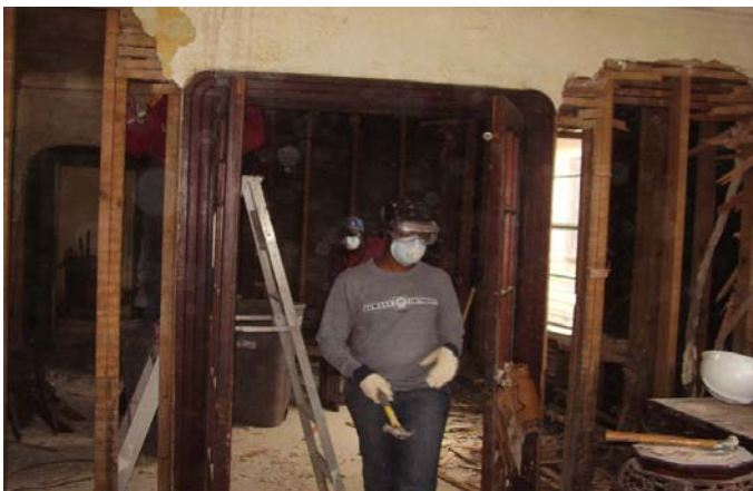
MB members in New Orleans assist in restoring a home damaged by Hurricane Katrina.