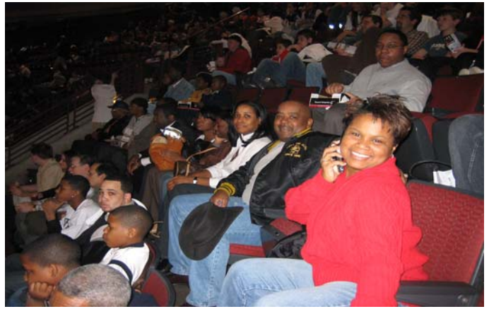
MB members enjoying a night out watching the Chicago Bulls at the United Center.