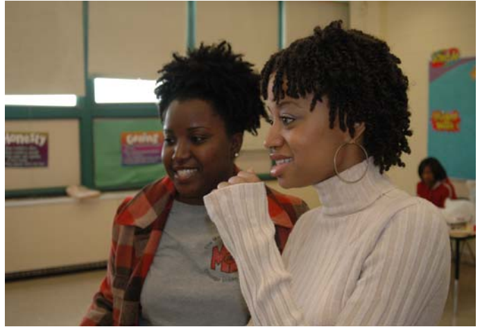
MB members look on as children perform an experiment during MB Lab.