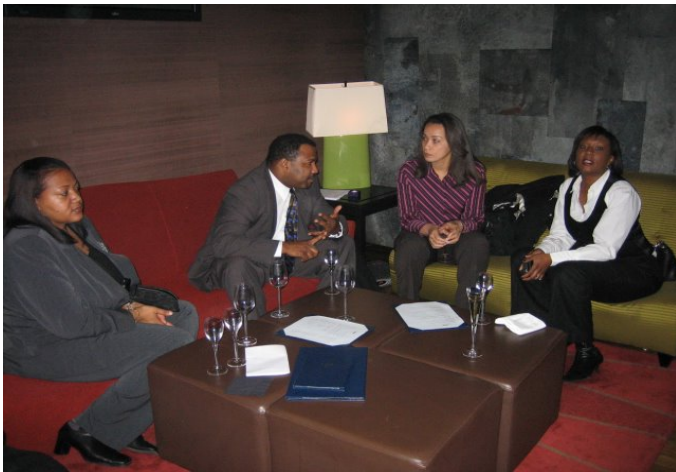
MB members chat during a wine tasting MB Power Hour.