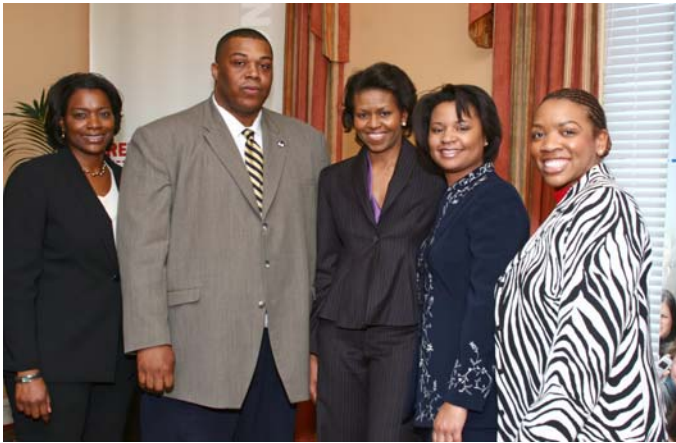
MB Executive Board members pose with Michelle Obama after the Women of Influence Breakfast.