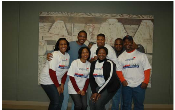
MB volunteers at the Greater Chicago Food Depository.

Everyone has an opportunity to be great because everyone has an opportunity to serve. —Dr. Martin Luther King Jr.